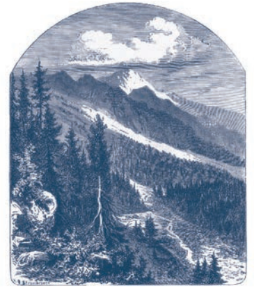
The Valley of Chamonix

time he will join the attempt for the summit. His first visit to the Alps was last year, when he spent many days trapped at the Riffel above Zermatt participating in little action due to the weather which was dismal. The famous Matterhorn declined to show itself fully during the whole of his sojourn. He hopes to see more this time around.