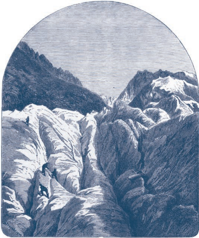
On the Mer de Glace