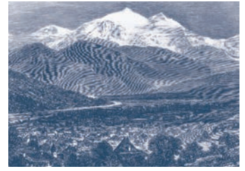
The Town of Chamonix with Mont Blanc above