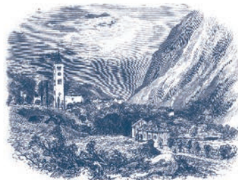
Courmayeur – under the rocky divide between Italy and France