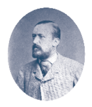
Harrow educated skilled climber