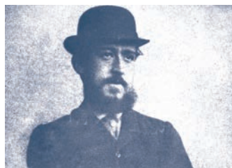
Adolphus Warburton Moore 1841–1887

Carrel and the Italian climbers must have been thwarted by the snow. It would seem they have spent many nights in their tent on the side of the mountain, unable to progress further. ■