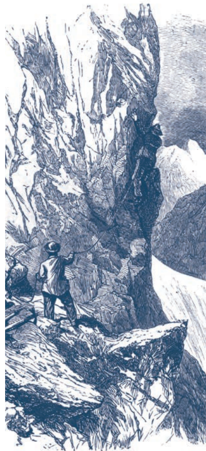
On the Matterhorn

The chance meeting of Mr Whymper and Lord Francis Douglas in Breuil developed into plans for an immediate assault on the mountain, soon followed by the engagement of Old Peter Taugwalder as guide. Then, as we were dining