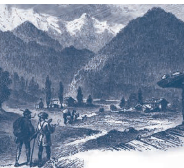
In the Valley of Chamonix

Front page: Chamonix Guides already have a guild that organises their work