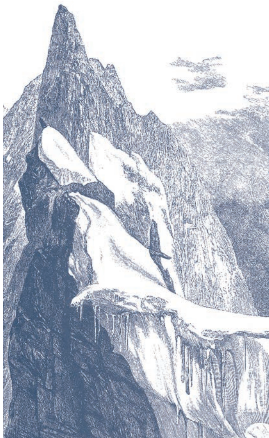
Crossing the Col Dolent