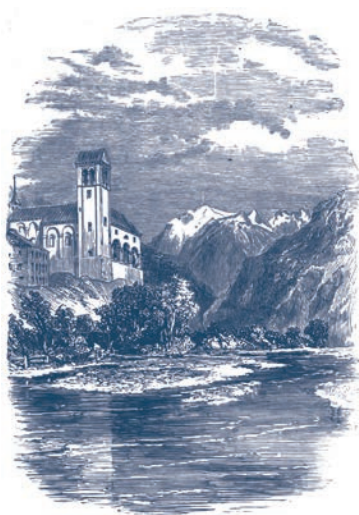
Leaving Zermatt and reaching the town of Visp

While sorting through his lost sibling's affairs, he found an article Lord Francis had penned about the Gabelhorn ascent with Taugwalder. It almost ended in tragedy when the cornice on the peak broke. They would both have tumbled to their deaths but were saved by the rope that tied them to the other guide, Viannin from Zinal. It is highly possible that this was the same sort of rope as that which broke on the Matterhorn. If such a rope had so recently saved his life, it is hardly surprising that Old Peter would consider it "special".