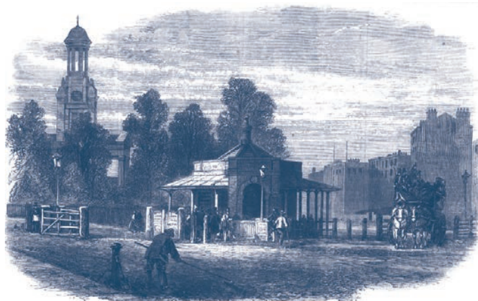
Kennington Road near Whymper's home in Lambeth